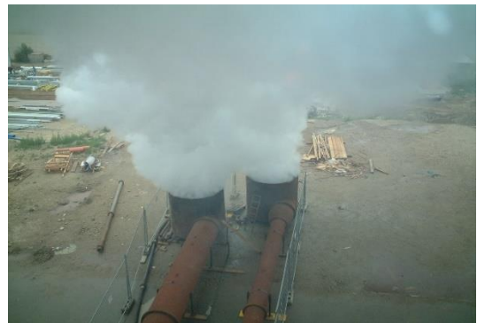
Steam separator (condenser)

Continuous steam blowing has certain advantages in comparison with shock blowing. Specially in combination with noise reduction by means of spray water inlet (so called quenching). As the K-factor is most important for a good steam blow result, continuous steam blow has the advantage to measure this factor for a longer period, as with shock blow the K-factor is reached for a short period. Second, the amount of demineralised water required for continuous steam blow is much less than with shock blow. Finally, in combination with spray water inlet noise reduction, the temporary pipe work of continuous steam blow will receive a max pressure of approx. 10 bar, which enables to use less expensive temporary piping. For shock blow the temporary piping up to the silencer is PN40 at least.