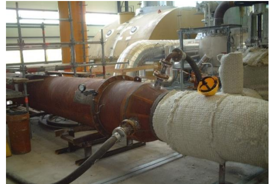
Quench water silencer

High pressure/temperature steam is actually water with enormous amount of energy. Releasing steam to the atmosphere with such energy gives a lot of mist formation and noise. To reduce noise levels to acceptable values, steam has to be cooled by condensation. There are two types of noise reduction methods. One is the classical silencer or knock out pot, which works like a type of cyclone; the increasing of the surface area will cool the steam. The second type of noise reduction works like spray water inlet in normal steam operations. At the end of the temporary steam blow pipe, water is introduced to cool down the steam and at the end of the line there is a condensate pot to collect the condensate steam. From this temporary condenser the water is used again for spray water inlet.