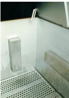
Ultrasonic bath with transducers fitted to the wall

Efficient cleaning is the result of optimum density, viscosity, surface tension and temperature. Vecom's cleaning liquids have been especially developed to work as efficiently as possible within the system. This is not the case with, for instance, emulsifying solvents that are ineffective when they are used in combination with ultrasonic energy (ultrasonic sound waves).