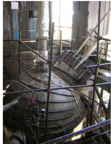
Upper surface of a urea stripper in Iran