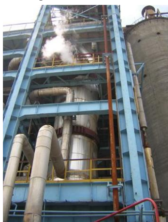
Urea stripper in Romania

On the 2 nd page you will see a graph depicting the progress of a Urea Stripper cleaning session and a reference list of urea cleaning operations carried out.